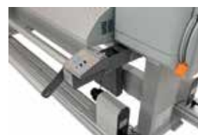
> 100 kg motorised take-up system