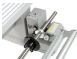
> 30 kg motorised take-up system