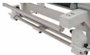
> 80 kg motorised take-up system