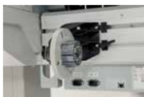
> repositionable scroller support

Depending on your volume and application needs, different optional motorised take-up systems for roll weights up to 30 kg are available. We also offer fully motorised roll-off/take-up systems for rolls up to 80 and 100 kg.